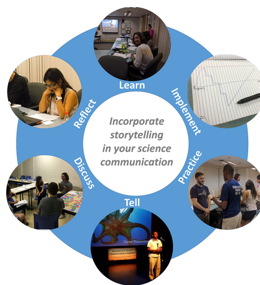
Fig. 1. The process of developing a science story using examples from a science storytelling training and live storytelling event at the International Marine Conservation Congress in July 2016. Scientist storytellers gained storytelling skills by learning and practicing techniques and developing a personal science story.

Where do you start when developing a science story? It begins with the same elements that are key to any other type of story, including characters, setting, plot, outcome, and resolution (Bower 1976), all of which are essential for creating drama (Erickson and Ward 2015). Drama is a sequence of events