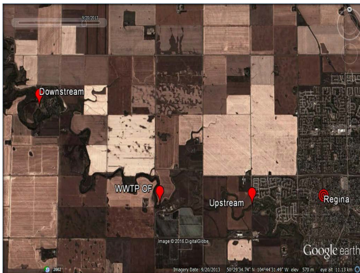
Fig. 1. Location of the three sampling sites northwest of the city of Regina, Saskatchewan, Canada. WWTP OF, wastewater treatment plant outflow. Map data attributable to Google Earth, Digital Globe 2016.

Three sampling sites were selected along Wascana Creek located on the northern outskirts of Regina in south-central Saskatchewan and sampled in July 2015 and July and August 2016 (Fig. 1). Wascana Creek is fed by Wascana Lake, a water storage system in the center of the city of Regina constructed in the late 1880s. There are no major population centers upstream of Regina. This area has a warm summer continental climate with strong seasonality and severe winters (Köppen–Geiger classification: Dfb). From 1991 to 2010, daily mean temperatures ranged from a mean winter temperature of -14.7^{\circ}\text{C} in January to a mean summer temperature of 18.9^{\circ}\text{C} in July (Environment Canada 2016). Mean precipitation ranged from 0.5 mm in December to 70.9 mm in June (Environment Canada 2016). Three sites were chosen in relation to Regina's WWTP