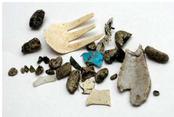
Fig. 5. Plastic items and pumice found in a pellet from a flesh-footed shearwater ( Ardenna carneipes ) from Lord Howe Island.

being lost to the environment or inflated because of additional plastic pieces from the environment. The GIT may be preserved (e.g., freezing or submersion in ethanol) so that it can be processed under controlled laboratory conditions at a later date.