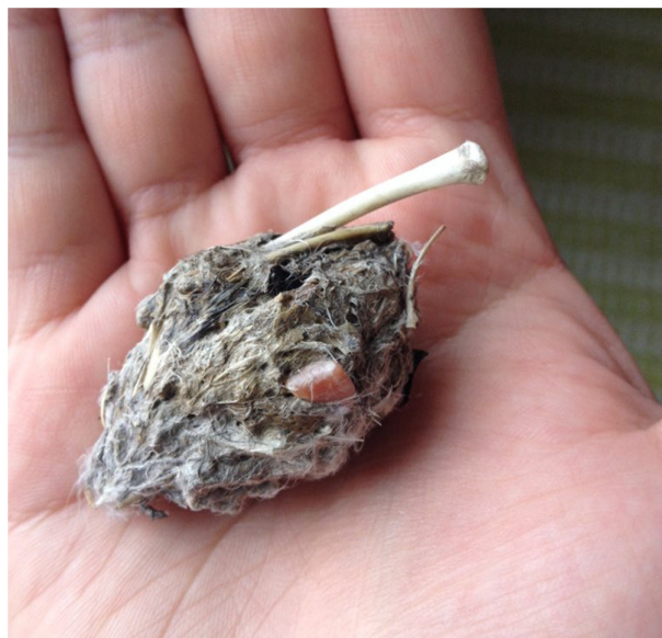
Fig. 3. A regurgitated pellet collected from a great skua ( Stercorarius skua ).

interest (Ryan and Fraser 1988; Votier et al. 2001; Hammer et al. 2016). In contrast to the accumulated plastics found during stomach dissections, pellets, like regurgitations, represent a snapshot of only a short period of time. Most pellet collections are also limited to the breeding season when marine birds are at terrestrial nesting sites, limiting seasonal comparisons in many species.