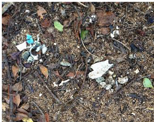
Fig. 4. Example of a sprayed regurgitation from a flesh-footed shearwater ( Ardenna carneipes ) from Lord Howe Island. These pellets are not intact, and thus of limited use to assess small microplastics that are easily lost to the environment.