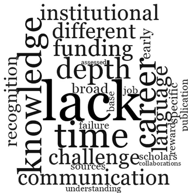
Fig. 4. What are the risks and drawbacks to engaging in interdisciplinarity? A word cloud of the top 25 synonymous words using the thematized coded text from authors' written discussions on the risks and drawbacks to engaging in interdisciplinarity. Larger fonts indicate greater word frequency. Note that the word "lack" was associated with some of the other words (e.g., lack of knowledge, recognition, time, depth, funding, etc.). (Word cloud created with Nvivo v. 12, QSR International Inc., Burlington, MA.)

The central risk of widening our horizons as researchers is that we skim the surface rather than delving deeply into the subject at hand ( Box 1 ). We must guard against superficiality. Just because one reads Clifford Geertz does not make one an anthropologist or even particularly knowledgeable about the debates and knowledge produced by that discipline. A number of interdisciplinary-friendly scholars have therefore warned of the danger of being disembedded altogether from disciplinary ways of knowing. Each of the authors of this article has a scholarly home-place, somewhere where we were trained, with whom we identify, teach, even belong. As interdisciplinary scholars, we also operate between, across, and through other disciplinary home-places, but our intellectual travels and interdisciplinary practices are not boundless.