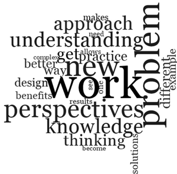
Fig. 3. What are benefits of interdisciplinarity? A word cloud of the top 25 synonymous words using authors' own descriptions of the benefits of interdisciplinarity. Larger fonts indicate greater word frequency. "Work" is the most frequent word constituting synonyms like bringing, exploit, form, processes, and make. (Word cloud created with Nvivo v. 12, QSR International Inc., Burlington, MA.)

"As a behavioural ecologist by training, I would have little success interpreting patterns of population size in some Arctic seabirds if I did not have some appreciation for oceanography and climate research, but I would also miss much if I didn't understand international politics as they relate to wildlife management, or if I failed to look into oral history of aboriginal peoples to assess long-term cyclical patterns in wildlife abundance."