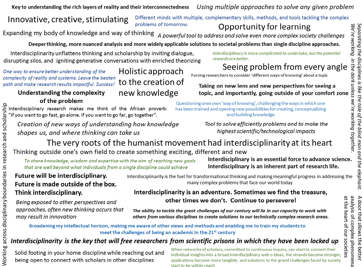
Fig. 7. Quotes from authors describing what interdisciplinarity means to them.