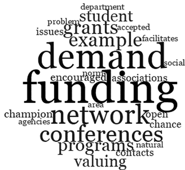
Fig. 6. What are facilitators to interdisciplinary research and scholarship? A word cloud of 25 stem words from coded text of authors' discussion on facilitators to interdisciplinary research and scholarship. Larger words illustrate greater frequency. Unlike the meaning of the word "funding" in Fig. 5, here it refers to funding agencies and programs as being key to facilitating and promoting interdisciplinary work. (Word cloud created with Nvivo v. 12, QSR International Inc., Burlington, MA.)

However, it can often be a challenge to find such conferences and spaces that are inherently interdisciplinary in scope. A good model for enabling such workshops are the "synthesis centers" in the United States that bring together diverse scholars to tackle interdisciplinary problems (see Baron et al. 2017 ).