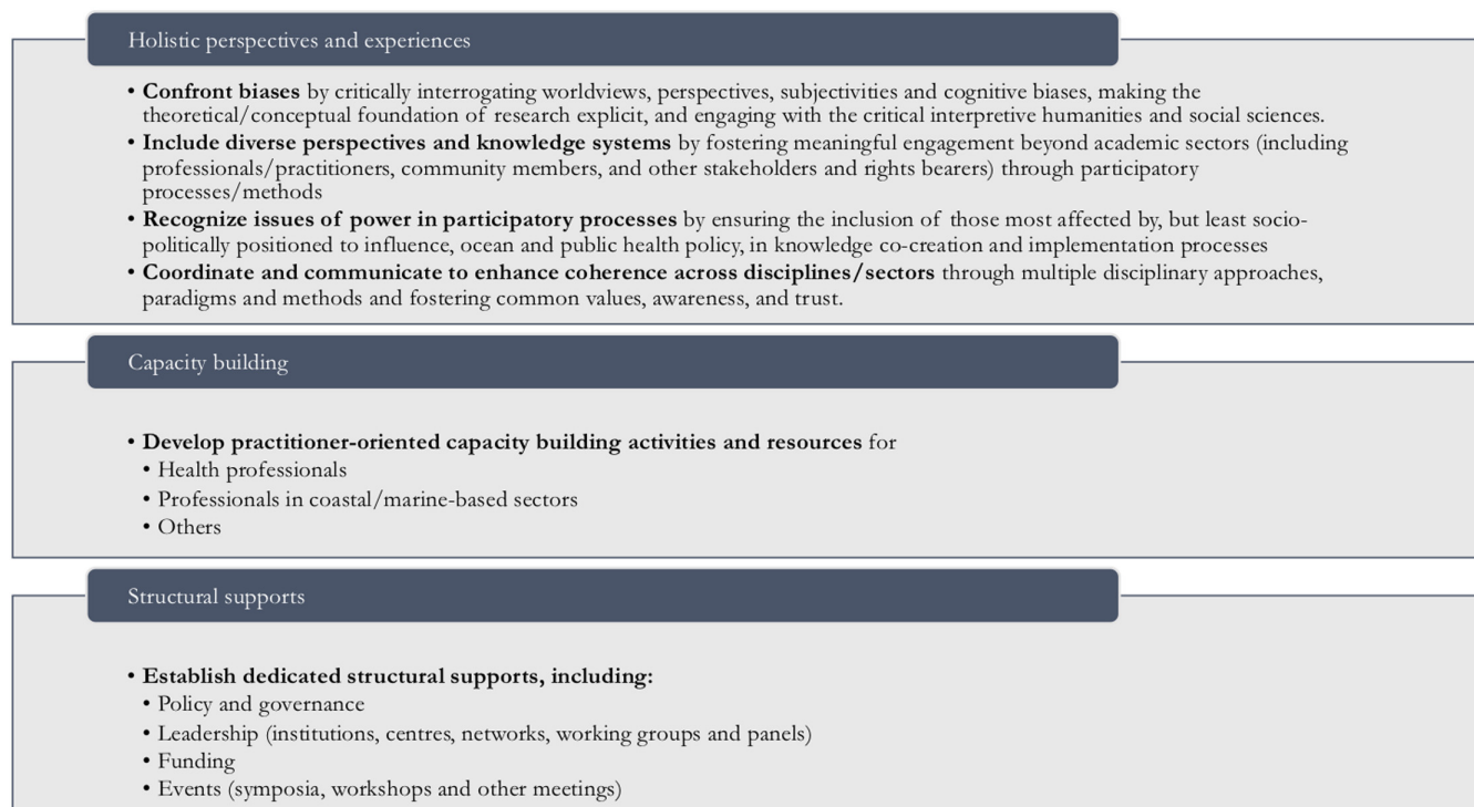
Fig. 3. Information derived from diverse perspectives (e.g., general public, policy makers), intellectual traditions and epistemologies, fields of scientific inquiry, approaches, and methods (e.g., empirical field/observational research, laboratory experiments, computational models, epidemiological modelling, clinical research, participatory and community-engaged research, analysis). Inference techniques can be highly complementary in yielding insights at the nexus of oceans and human health. Ensuring sustained collaboration and coordination, however, requires three key dimensions, namely—holistic worldviews and perspectives, dedicated capacity building opportunities, and structural supports.

traditionally emphasized biomedical issues and bioanalytical approaches from the toxicological, nutritional, and epidemiological sciences (Dewailly et al. 2002; Knap et al. 2002), whereas more broadly, interdisciplinary environmental health research in Canada has been dominated by quantitative studies in which physical health outcomes are emphasized (Masuda et al. 2008). Although such empirical positivist research often does not explicitly refer to a theoretical or conceptual foundation or framing, and the researchers conducting the analysis often assume a “value-free” research orientation (Masuda et al. 2008), values and assumptions that can be traced to renaissance Europe are often nevertheless embedded in the entire research process (Krieger 2011; Rigg and Mason 2018; Soto and Sonnenschein 2018). The choice of theory, method, and engagement (i.e., the framing) determines which conceptualizations, causal interpretations, moral evaluations and (or) treatment recommendations arise among a multiplicity of potential perspectives. Consequently, the framing determines which questions are asked, how knowledge is produced, and how issues are interpreted, prioritized, moralized, and responded to (Entman 1993; Chong and Druckman 2007).