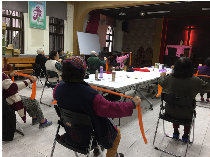
Fig. 2. Bnkis engaged in the Day Club activities.

absence of conceptualizing elderly care in the Tayal way at a collective level affects their mental and psychological health. Therefore, a further question should be asked: how can the wholistic concept and approach help to overcome these deficiencies in the current elderly care system?