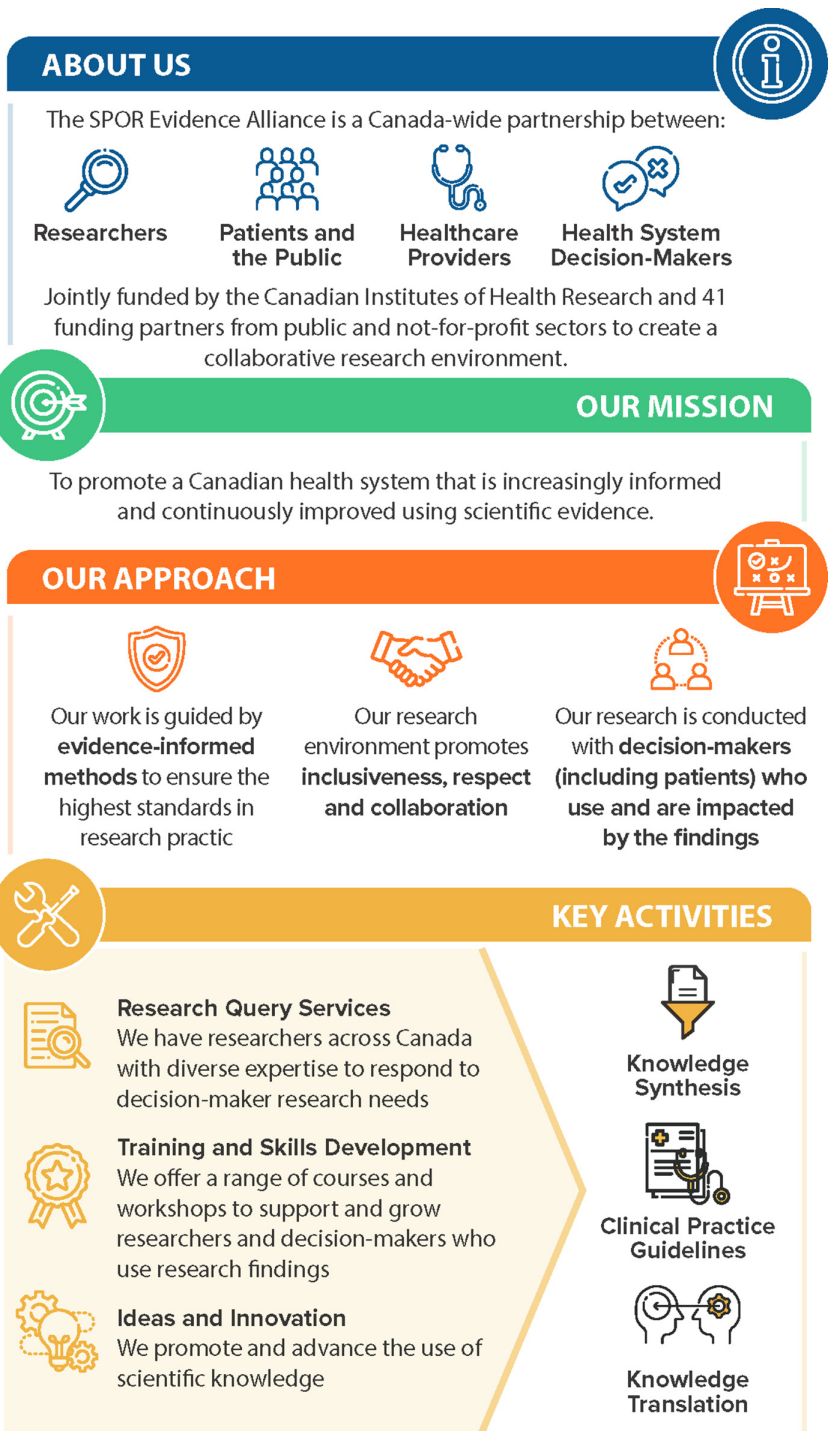
Fig. 1. A visual profile of the SPOR Evidence Alliance.