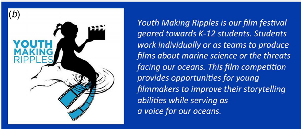
Fig. 1. (a) Image showing an audience participating in a Beneath The Waves (BTW; beneaththewaves.org ) film festival. BTW film festivals occur in different locations around the globe and feature a handful of films from their collection highlighting local and global conservation issues. At the end of the films, the audience interacts with invited scientists and engages in informal discussion about science and aquatic conservation. There is also a series of events (b) targeted toward youth and delivered in schools.