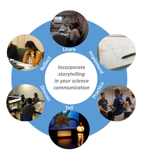
Fig. 1. The process of developing a science story using examples from a science storytelling training and live storytelling event at the International Marine Conservation Congress in July 2016. Scientist storytellers gained storytelling skills by learning and practicing techniques and developing a personal science story.

Where do you start when developing a science story? It begins with the same elements that are key to any other type of story, including characters, setting, plot, outcome, and resolution (Bower 1976), all of which are essential for creating drama (Erickson and Ward 2015). Drama is a sequence of events