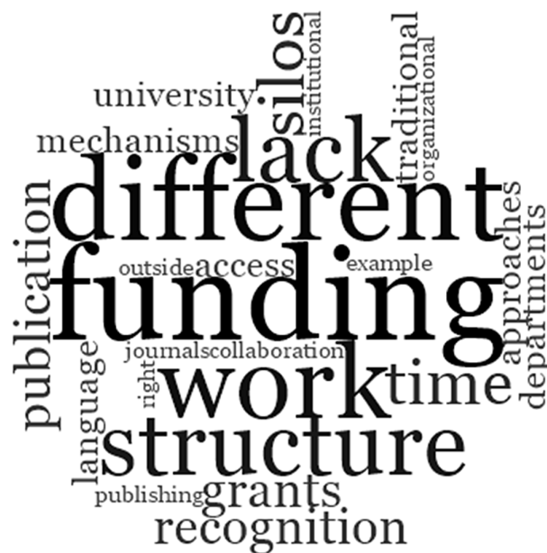
Fig. 5. What are challenges and barriers to engaging in interdisciplinarity? The top 25 synonymous words using the thematized coded text of authors' discussions on the challenges and barriers to engaging in interdisciplinarity. Larger fonts indicate greater word frequency. The most frequent words “funding” refers to barriers in funding mechanisms and “different” was often associated with challenges with different fields, norms, departments, work, etc. The word “work” also describes processes, and “structure” was often associated with challenges in funding, institutional, and organizational structures. (Word cloud created with Nvivo v. 12, QSR International Inc., Burlington, MA.)

Barriers and challenges to engage in interdisciplinarity have been discussed in prior literature but often come from the perspective of a discipline or field of study (e.g., Fox et al. 2006). Here, we list the challenges and barriers that were experienced from a range of disciplinary perspectives by College members and depict the most frequent words used by authors to describe the challenges in a word cloud (Fig. 5).