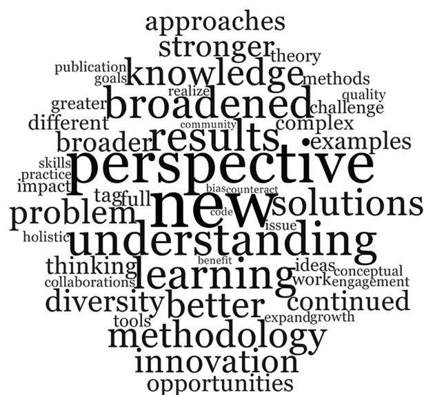
Fig. 2. What does interdisciplinarity mean? A word cloud of the top 50 words from text written by the authors describing what interdisciplinarity means to them. Larger words illustrate greater frequency counts. (Word cloud created with Nvivo v. 12, QSR International Inc., Burlington, MA.)

“I consider it a mostly meaningless academic buzzword. I do use it, however, but largely in grant applications and similar genres of writing in which I try to give institutions the kinds of text that I presume they are looking for.”