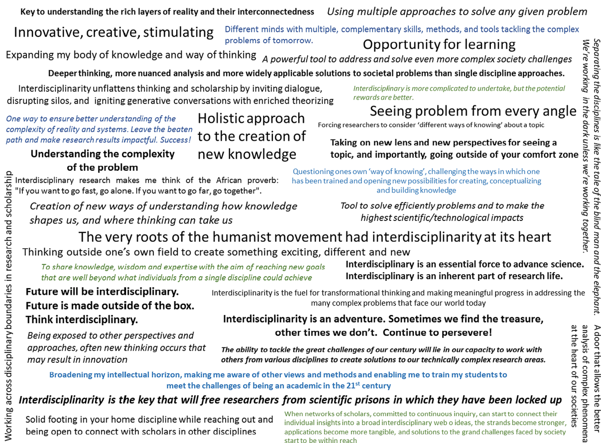
Fig. 7. Quotes from authors describing what interdisciplinarity means to them.