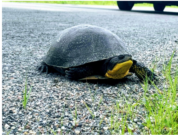
Fig. 1. A species likely to be negatively impacted by the changes to Ontario's Endangered Species Act is the Blanding's turtle ( Emydoidea blandingii ) population of North Shore, Ontario, as this population is located on land slated for development into a quarry. Under the new legislation, developers can pay into a Species-at-Risk Conservation Fund. The fund is designed to allow developers to pay money instead of refraining from activities that may harm an at-risk species. It is up to the provincial government to decide if the quarry project may proceed (Semeniuk 2019).

In this editorial, we outline why these five fundamental changes are likely to put Ontario's species at greater risk of extinction (see example in Fig. 1). The following concerns are listed in the order in which they affect the species protection process, from species-at-risk listing to management. Although we acknowledge that endangered species legislation is often viewed as cumbersome and difficult to implement (Schwartz 2008; Bird and Hodges 2017), we argue, as do others (e.g., Waples et al. 2013; Evans et al. 2016; Westwood et al. 2019), that adequate species protection can only be achieved when strong legislation is in place. For each of our concerns, we provide alternative recommendations for ways Ontario could better protect species at risk and their habitats.