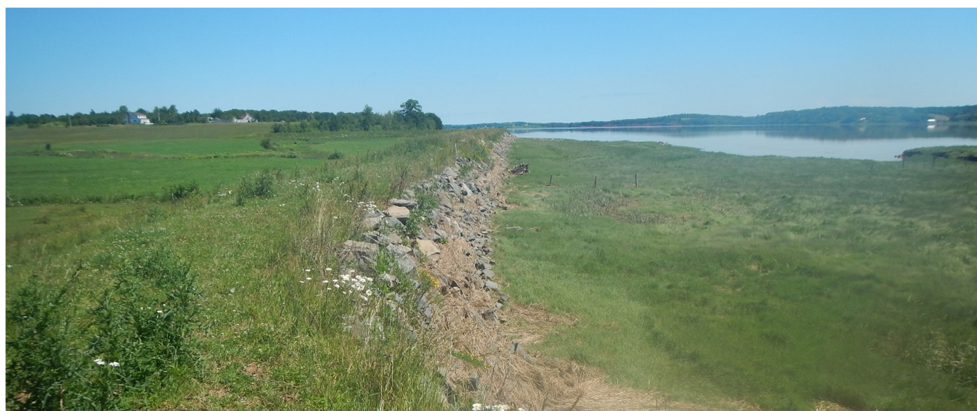
Fig. 1. The Elderkin Dyke near the Windsor Causeway, NS, showing agriculture, dyke, and foreshore marsh from left to right.

Reinforcing dykes and aboiteaux to maintain dykelands and restoring wetlands both affect the provision of ecosystem services (ES)—akin to what the Intergovernmental Panel on Biodiversity and Ecosystem Services now calls Nature's Contributions to People ( sensu Díaz et al. 2018)—and, in some cases, result in disservices or unwanted consequences for society. ES are categorized as provisioning/material (e.g., food production), regulating (e.g., water filtration), and cultural/nonmaterial