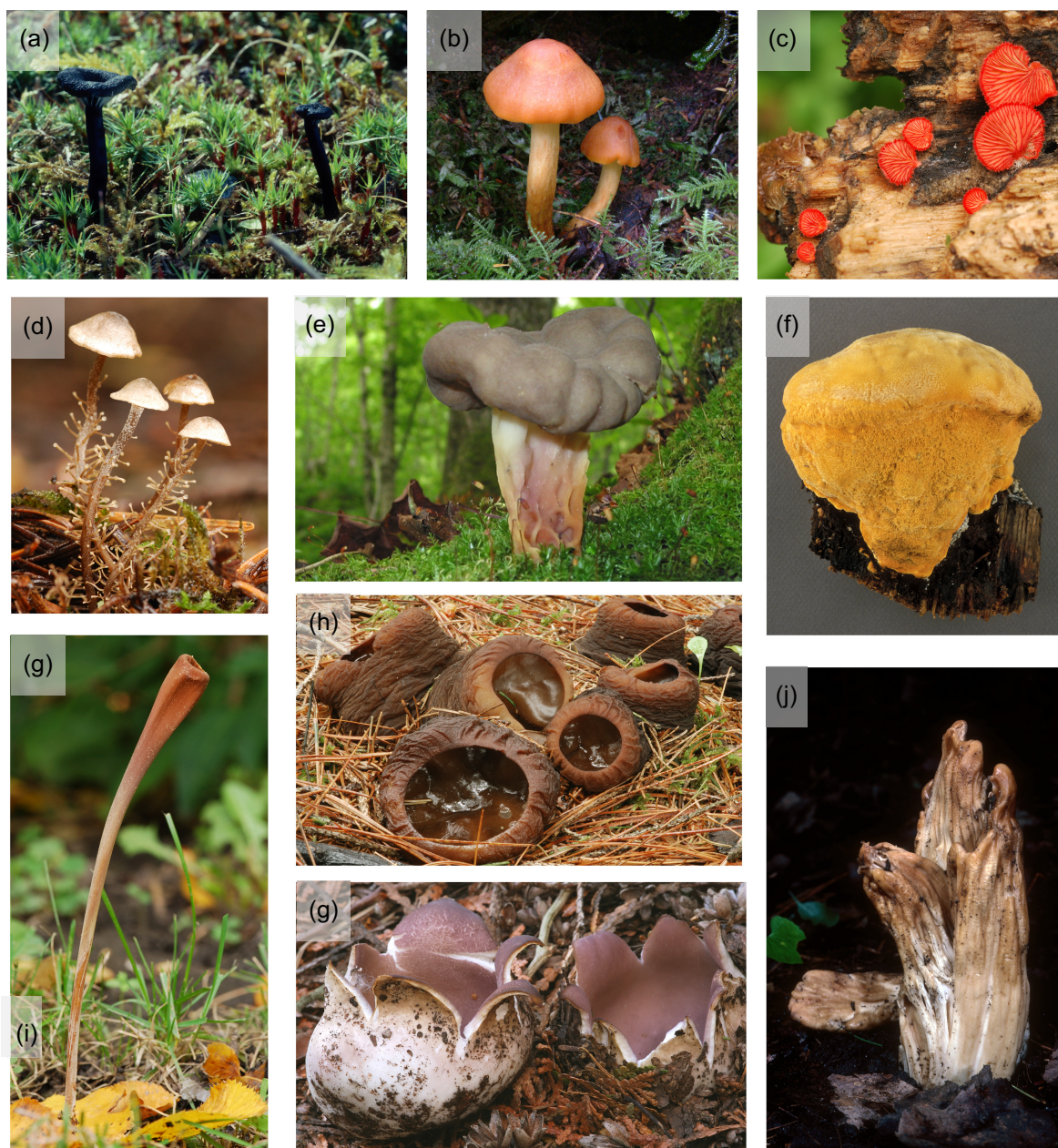
Fig. 2. A selection of macrofungi that are putatively rare in Canada. (a) Arrhenia chlorocyanea (photo G. Thorn), (b) Cortinarius kroegeri (photo B. Kendrick), (c) Crepidotus cinnabarinus (photo R. Lebeuf), (d) Dendrocollybia racemosa (photo R. Lebeuf), (e) Gyromitra sphaerospora (photo J. Landry), (f) Hapalopilus croceus (photo Y. Lamoureux), (g) Macrotyphula fistulosa (photo R. Lebeuf), (h) Sarcosoma globosum (photo R. Lebeuf), (i) Sarcosphaera coronaria (photo R. Lebeuf), and (j) Underwoodia columnaris (photo G. Thorn).

approximate) distribution data are lacking for most macrofungal species in North America. The conservation directive is that Canada becomes responsible to maintain those species in the world. The practical consequences of the “conservation directive” depends on the case that can be presented to government agencies to act upon the conservation issue. By identifying priority targets